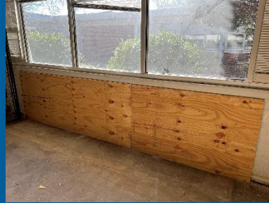
Temporary plywood to secure locations where equipment was removed and prevent moisture intrusion