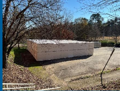
Delivery of roof insulation material and storage in lower parking lot