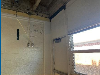
Layout of new mechanical duct for holes to be cut in Area D