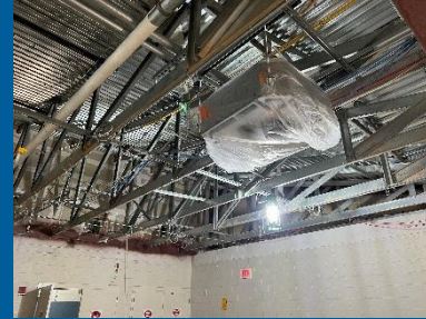
VRF cassette and electrical rough-in of unit at Gym Balcony