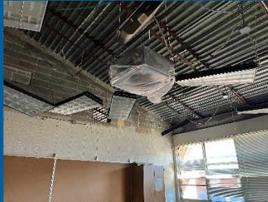
Rough-in of VRF cassettes and conduit in Area B