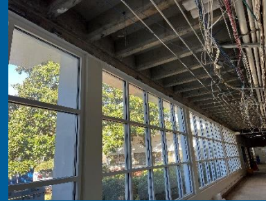
Water piping from previous air conditioning system removed from Area E