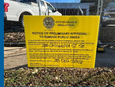
Posting of trees to be removed for Arborist Department signoff